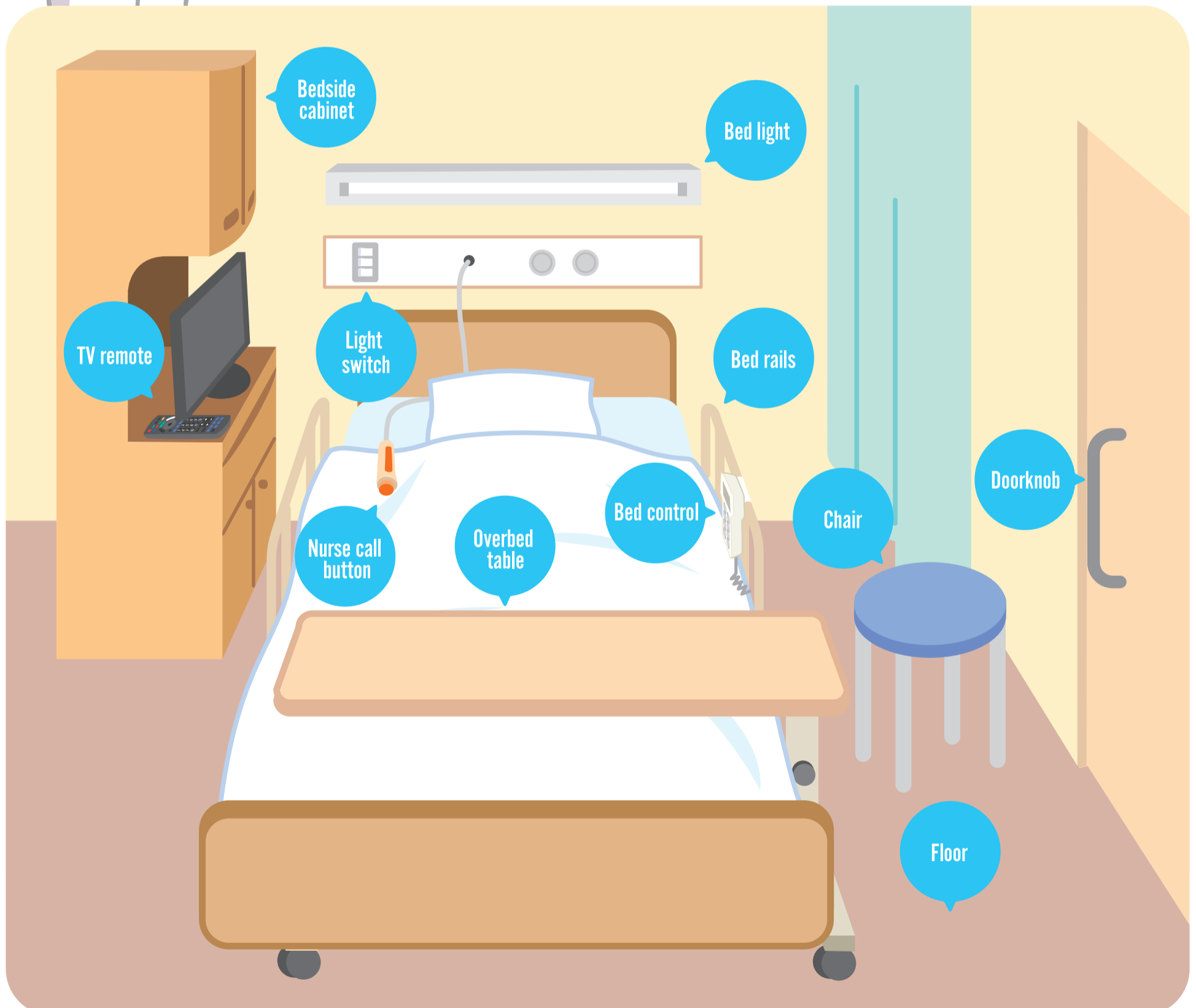
Cleaning areas in the Patient's Room (example)