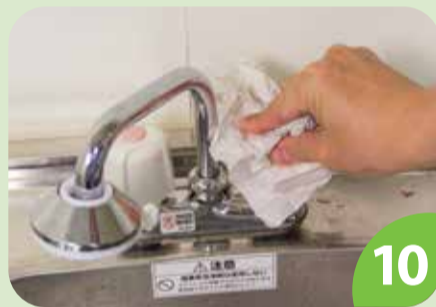
10 Use towel to turn off faucet