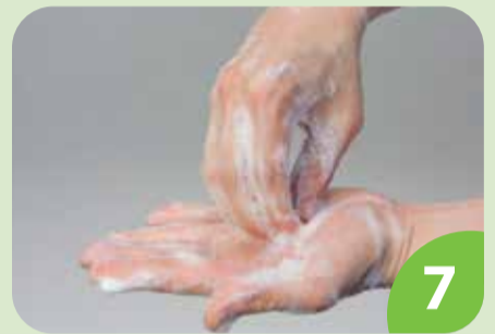
7 Rotational rubbing, backwards and forwards with clasped fingers of right hand in left palm and vice versa