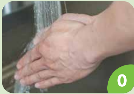
0 Wet hands with water

Duration of the entire procedure : 40-60 seconds