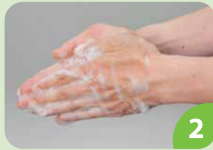
2 Rub hands palm to palm