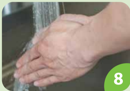
8 Rinse hands with water