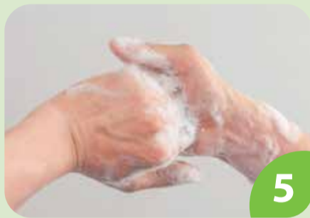
5 Backs of fingers to opposing palms with fingers interlocked