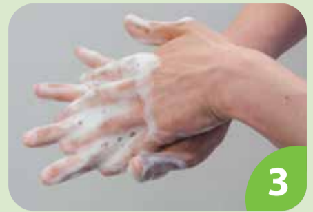
3 Right palm over left dorsum with interlaced fingers and vice versa