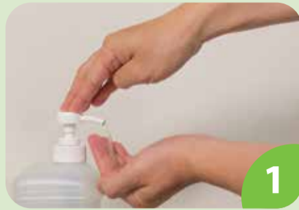
1 Apply enough soap to cover all hand surfaces