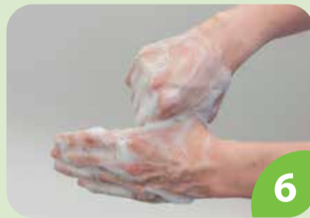
6 Rotational rubbing of left thumb clasped in right palm and vice versa