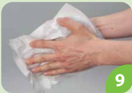
9 Dry hands thoroughly with a single use towel