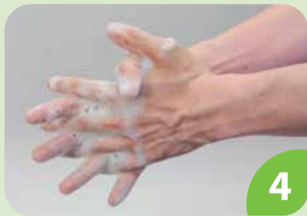
4 Palm to palm with fingers interlaced